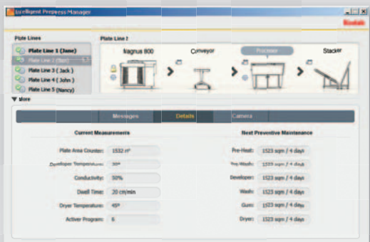
The iPM 2.0 pop-up screen appears only when notification is needed. This screen displays details about online processors.