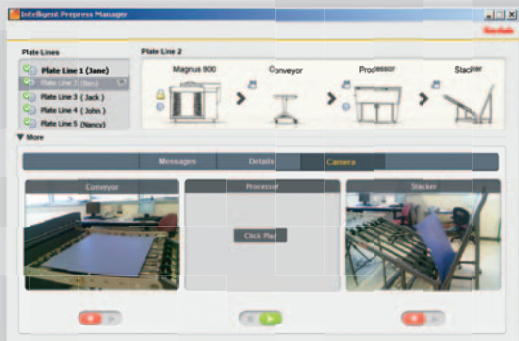
This screen displays online camera details.