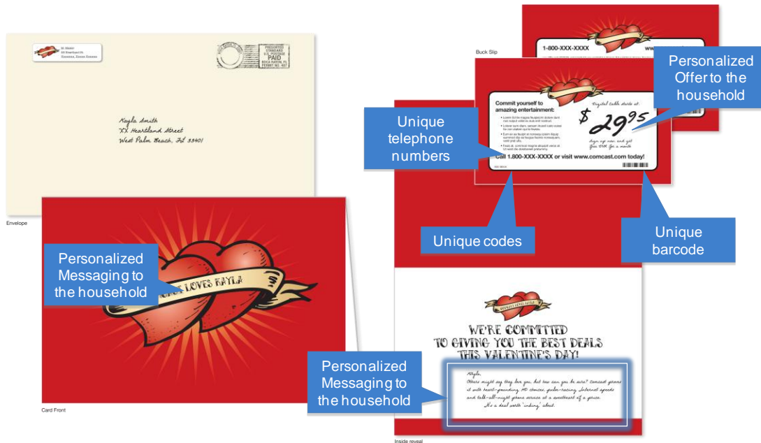
Figure 5: Wilen Direct Tracking via Unique Data-Specific Messaging

data-specific messaging and use that in producing a relevant and measurable campaign. Applying this in practice is where Wilen’s Kodak Versamark DS6240 heads and Prosper S10 Imprinting System come into play. At 240 by 240 dpi and with speeds up to 1,000 feet per minute (305 meters per minute), the DS6240 head is a high-volume workhorse. The Prosper S10 can achieve the same top speed, but at a 600 by 600 dpi resolution. This changes the possible application set. Figure 6 shows the kind of application that Wilen typically handles with its DS6240 heads. Code numbers, telephone numbers, and bar codes are text elements that can be rendered effectively at 240 dpi. When small text, complex linework, and/or halftones are required, the capabilities of the S10’s 600 dpi resolution become apparent.