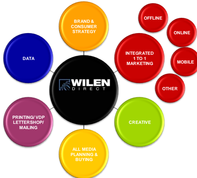
Figure 4: Wilen Direct Service Positioning

In describing its service offerings, Wilen Direct provides customers the choice of á la carte services or total turnkey solutions (see Figure 4). These capabilities include brand & consumer strategy, integrated 1:1 marketing, creative services, media planning & buying, printing & mailing, as well as data services.