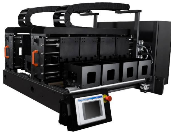
Figure 2: Kodak Versamark DC3800 8-Head 2-Rail Printhead Carriage System

Figure 3 takes us to the next step, showing how the heads are mounted on an actual press. This example comes from drupa 2008 when Kodak showed the S10 heads (then known as the “Stream Concept Printhead”) mounted on a Muller Martini web offset press.