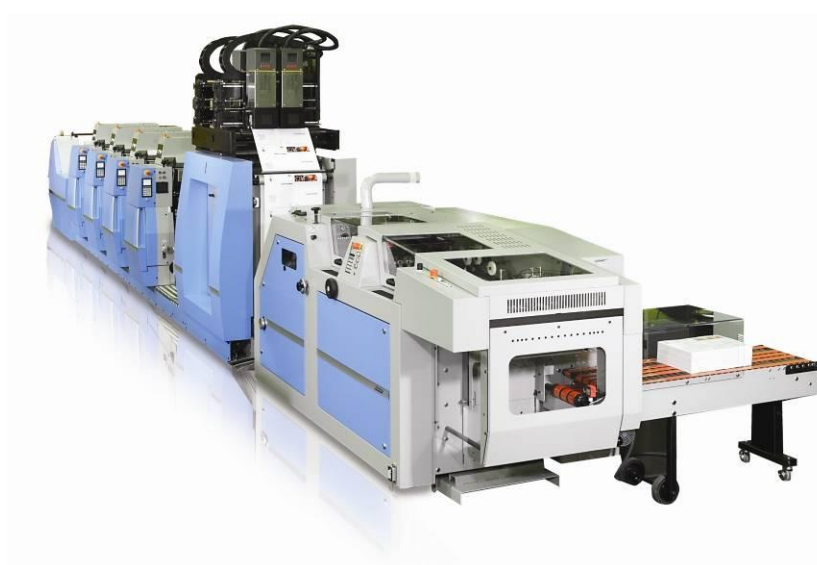
Figure 3: Kodak Stream Concept Printheads Mounted on a Muller Martini Press

Figure 3 takes us to the next step, showing how the heads are mounted on an actual press. This example comes from drupa 2008 when Kodak showed the S10 heads (then known as the “Stream Concept Printhead”) mounted on a Muller Martini web offset press.